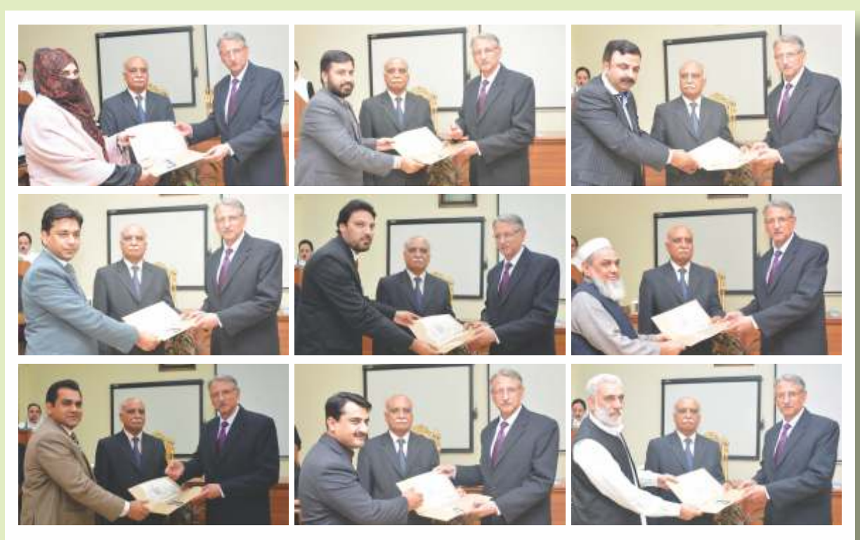
Registrar, Supreme Court Awards certificates in the ceremony.