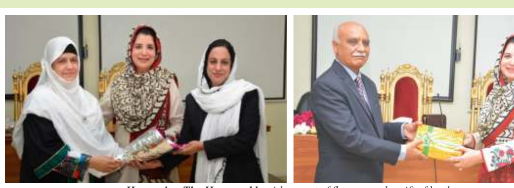
Honouring The Honourable: A bouquet of flowers and a gift of books being presented to the Hon'ble Chief Guest in the ceremony.