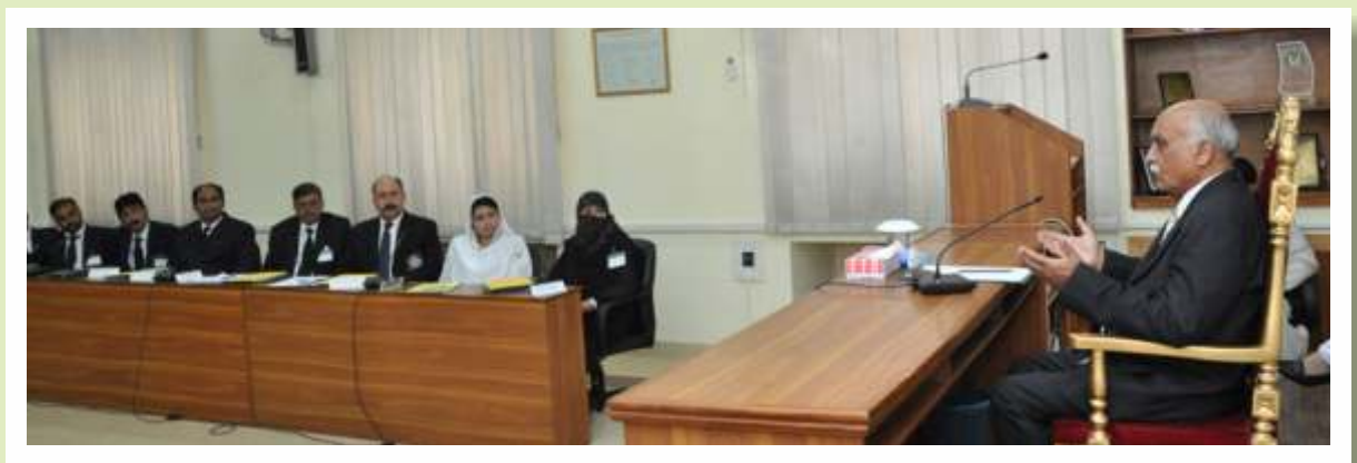
Knowledge Empowers: DG addressing the Prosecutors in the inaugural ceremony.

Twenty four Prosecutors underwent this oneweek training at the Federal Judicial Academy.