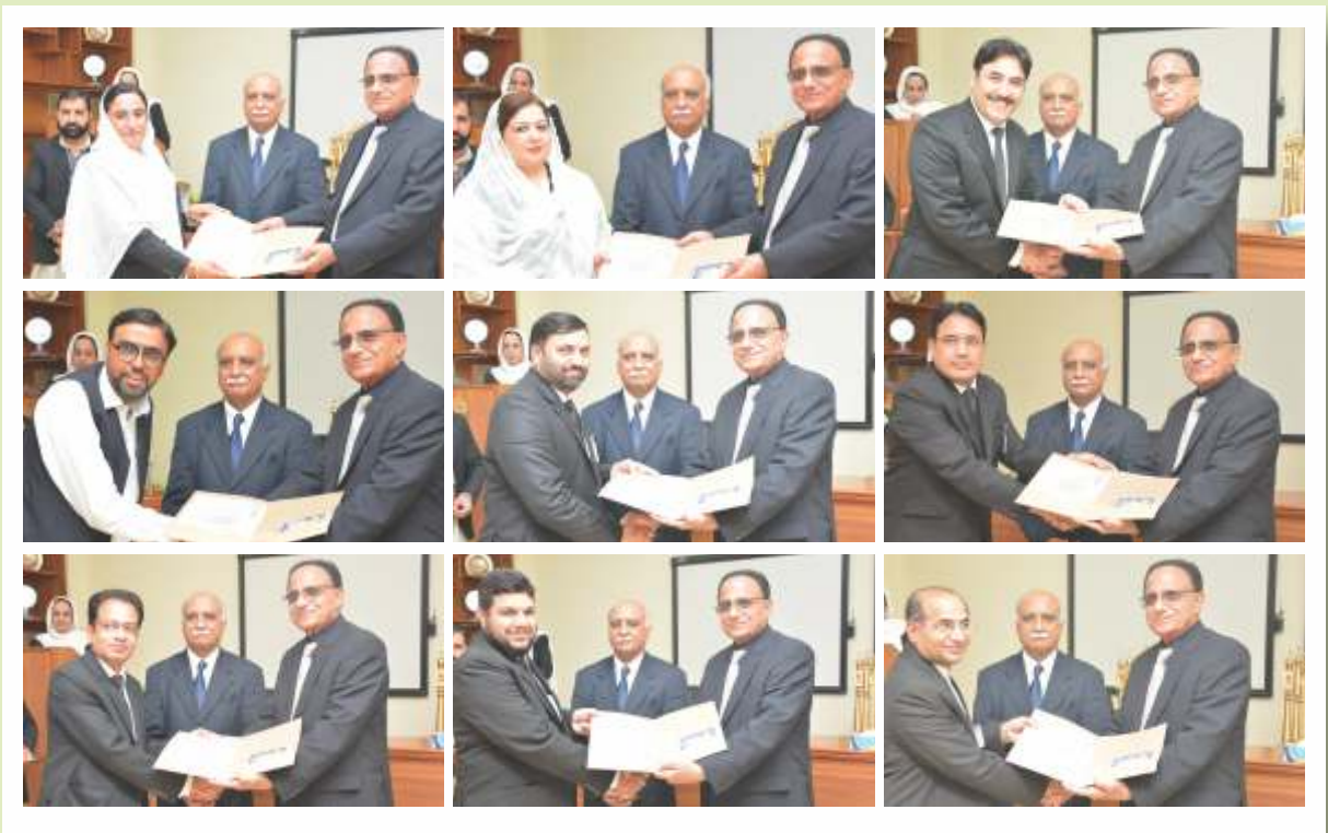
Inspire others with your Achievements: Hon'ble Judge awards certificate to the course participants.

Academy and said, "We gained a lot during this one week training. It has really enhanced our professionalism."