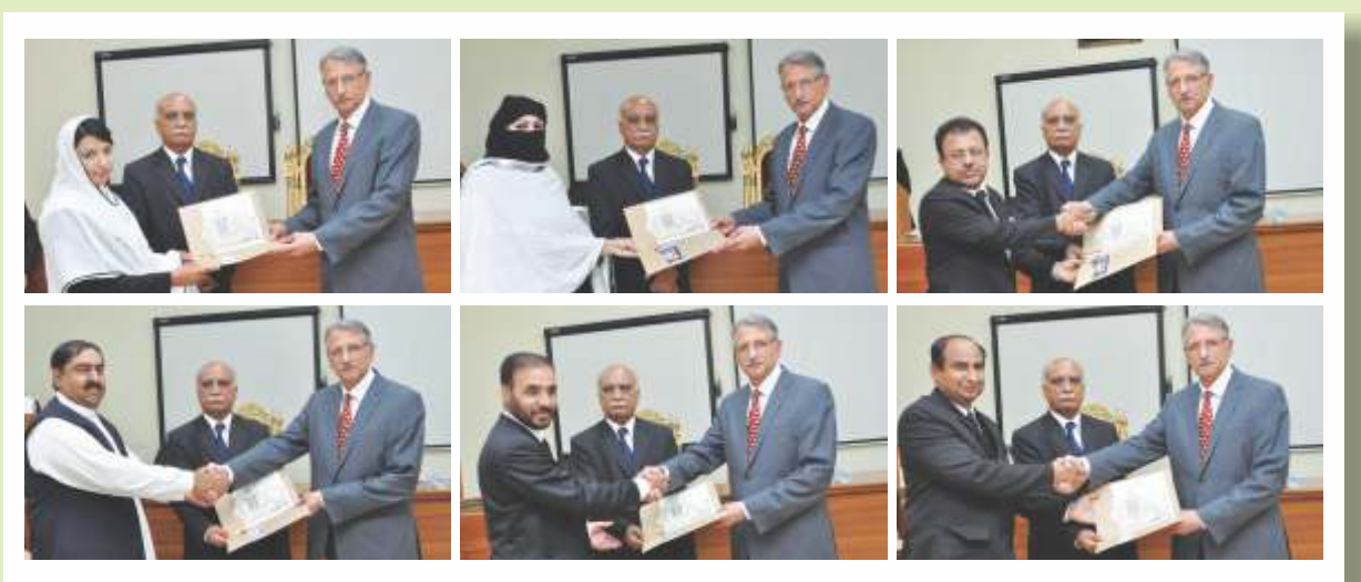
Man gives the Award but God gives the Reward: Registrar, SCP, awards certificates in the ceremony.