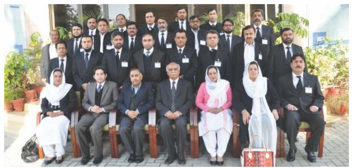
Unity is Indispensable: Additional District and Sessions Judges in group photo with DG and other Faculty Members.