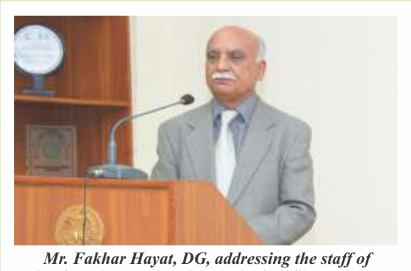
Academy in a two week capacity building training.

He said, "The FJA always encourages trainees to focus more carefully on the quality and quantity of their work where needed."