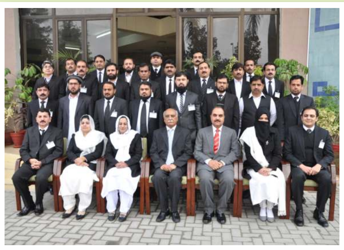
Trainees in group photo with DG and other faculty members.

Twenty- six Civil Judges-cum-Magistrates from all over Pakistan, Azad Jammu and Kashmir and Gilgit-Baltistan underwent this one week training at the Federal Judicial Academy.