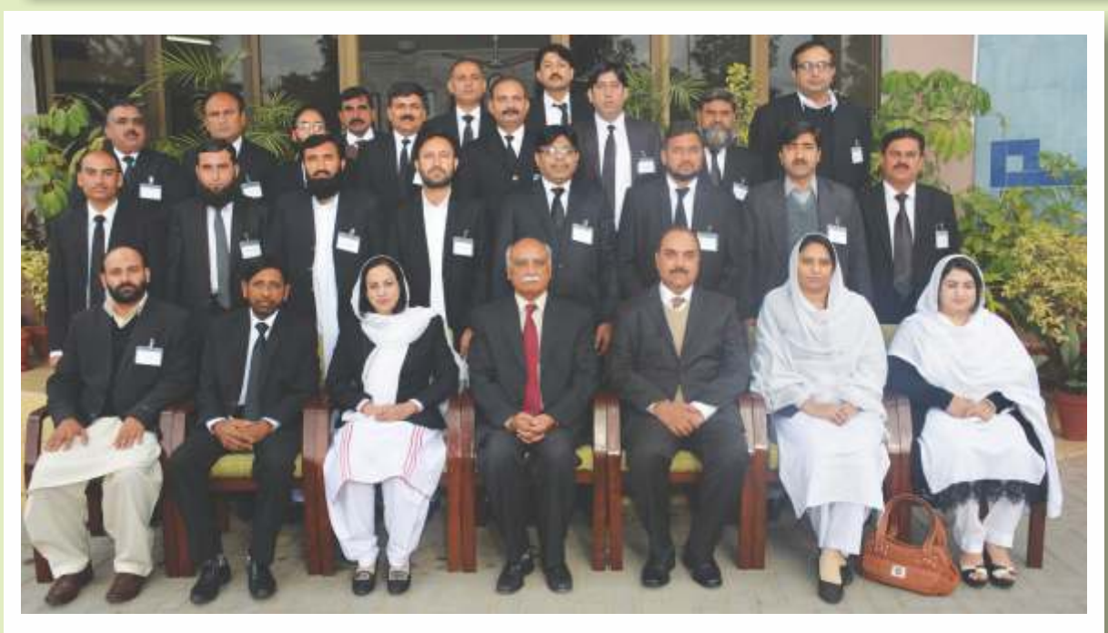
Knowledge Integrates: District Attorneys/Deputy District Attorneys in group photo with DG and other Faculty members.