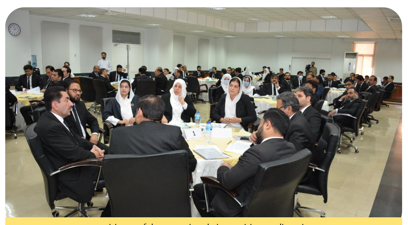
participants of the symposium during participatory discussion

This initiative by the FJA played a significant role in fostering a culture of alternative dispute resolution, ultimately contributing to the overall improvement of the judicial system in Islamabad.