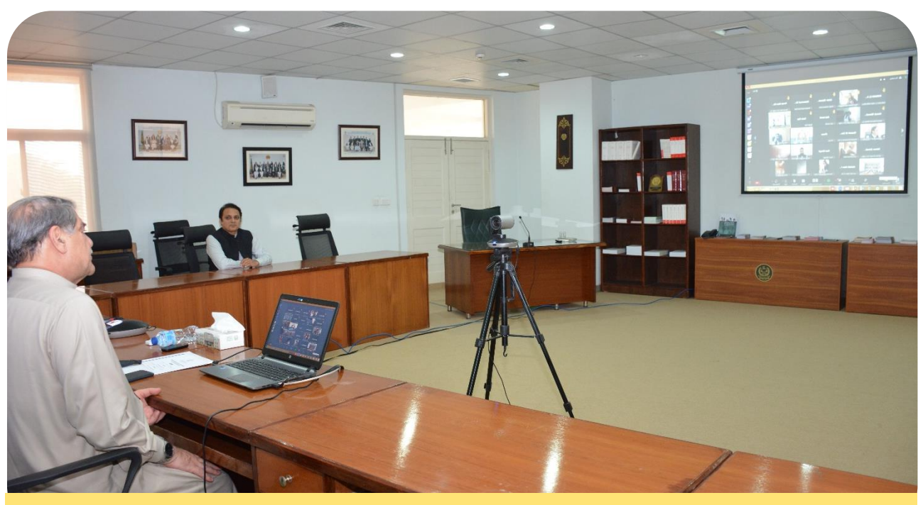
DG, FJA delivering an open address on a webinar on "ADR-The Way Forward"

This FJA's webinar aimed to pave the way forward for the adoption and integration of ADR practices in the judicial system of Pakistan, ultimately enhancing access to justice and promoting efficient dispute resolution.