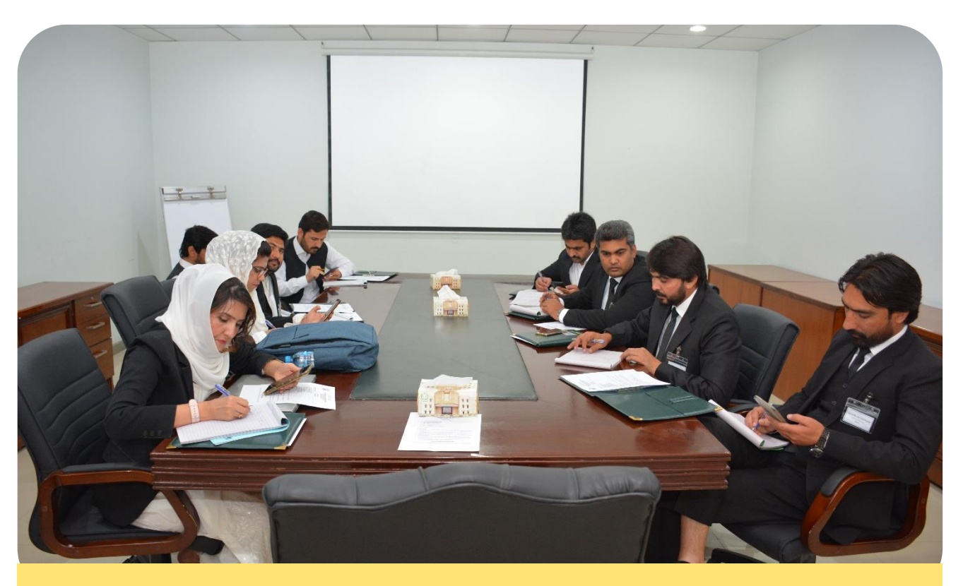
Participants during the Syndicate Discussion