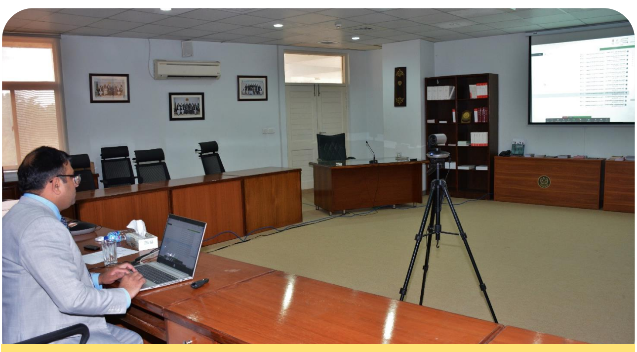
Deputy Director, FJA conducting webinar on "Use of IT in Justice Sector"

Through interactive discussions and practical examples, the webinar provided the participants with valuable knowledge and resources to harness the power of technology in their daily work. By promoting the use of IT in the justice sector, the FJA's webinar tried to assist in accelerating the adoption of digital solutions, streamlining court operations, and ultimately enhancing access to justice for all citizens of Pakistan.