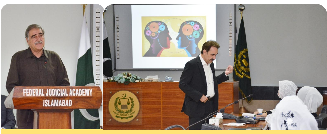
DG, FJA during the inaugural session

The program was designed to enhance the knowledge, skills, and professional development of public prosecutors, enabling them to effectively perform their crucial role in the criminal justice system. This training covered various aspects, including Evidence-The Judges Perspective, Criminal Trial Procedures, Common Errors in Prosecution, Legal Framework on trafficking in Person, Use of IT in Justice Sector. Through a combination of theoretical sessions and practical exercises such as Syndicate Discussion/Presentation and Research Assignments, the training aimed to enhance the professional capabilities of public prosecutors, enabling them to perform their duties with utmost competence and integrity.