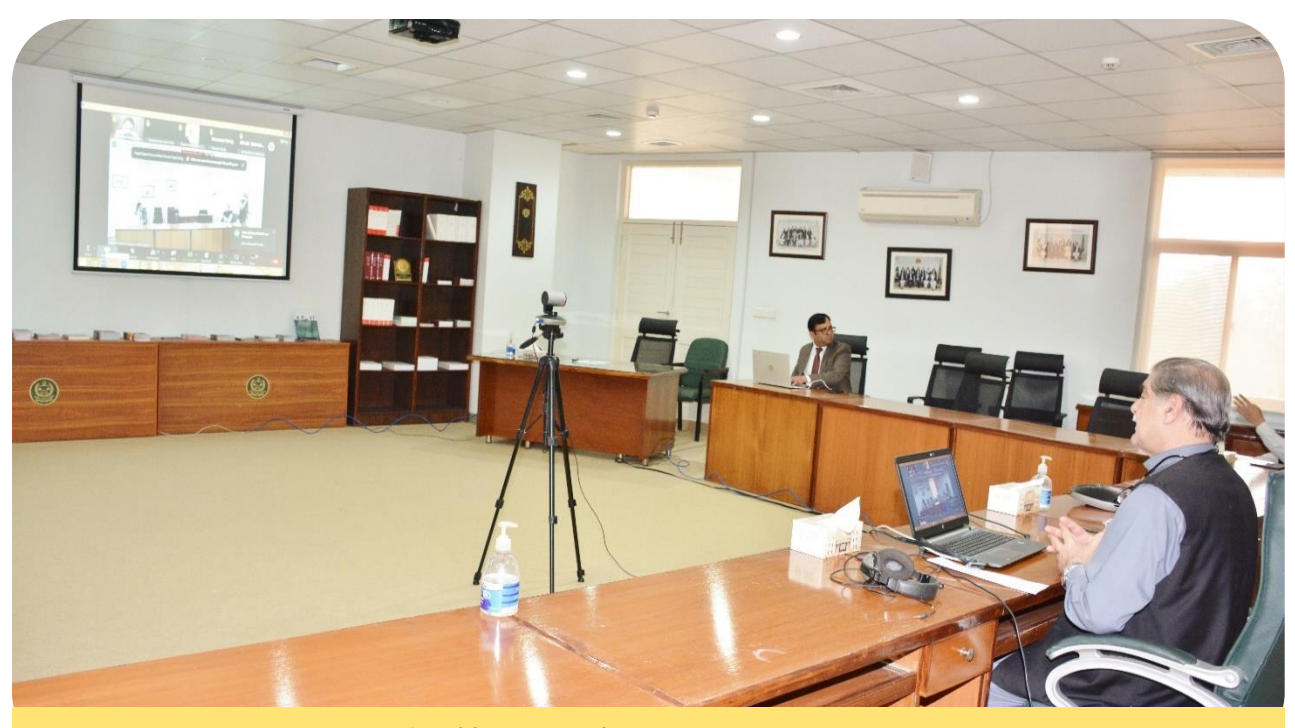
DG, FJA addressing webinar session via Zoom Meeting