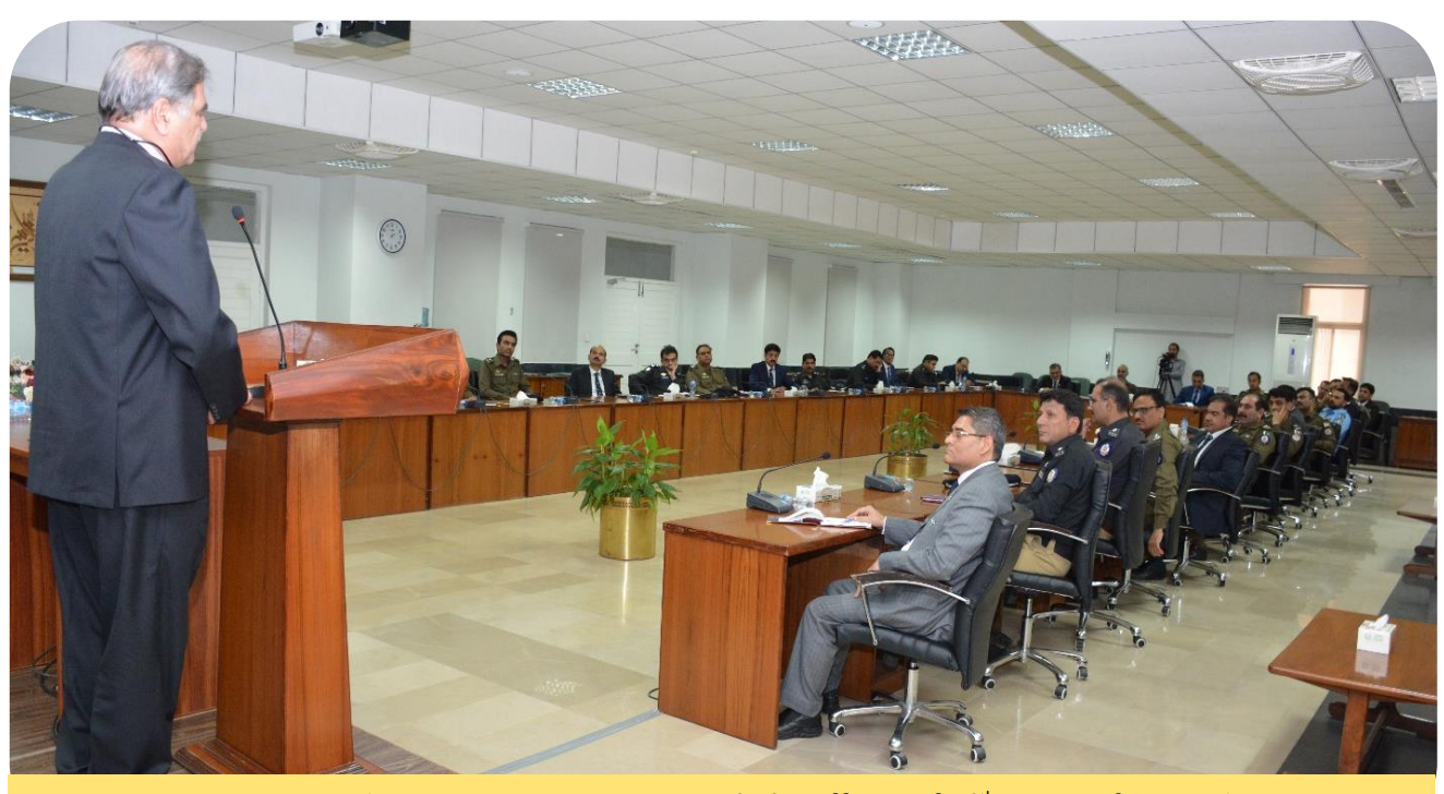
DG, FJA in an interactive session with the officers of 36th MCMC from NPA

The participants were briefed on the work and mandate of FJA. The distinguished DG (Director General) of FJA, actively engaged with participants and addressed their inquiries regarding the gaps within the criminal justice system. They shed light on the gray overlapping areas that exist between the roles and responsibilities of the police, investigation agencies, and the judiciary. The session concluded with a vote of thanks and refreshments.