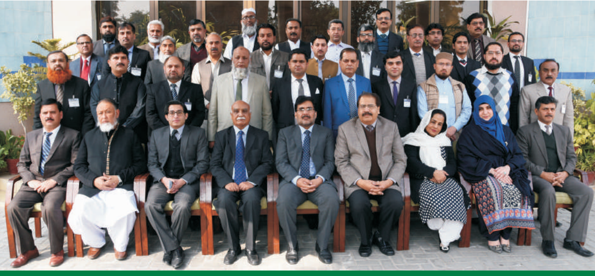
Trainees in group photo with Chief Guest and faculty members.