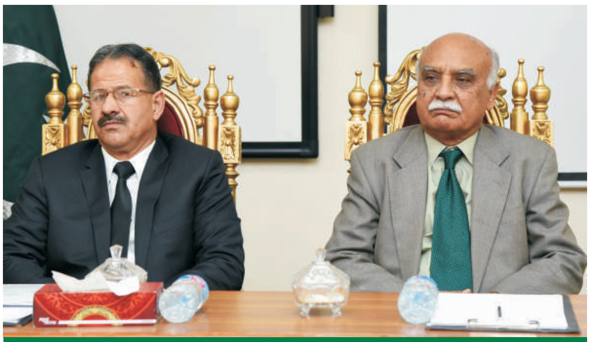
Registrar, High Court of Azad Jammu & Kashmir and DG, FJAsitting on the stage.

Registrar, High Court of Azad Jammu & Kashmir