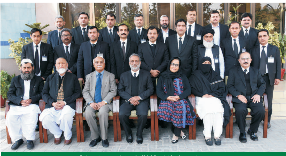
Trainees in group photo with Chief Guest & faculty members.

"The subjects and topics which you have been taught here, those are not taught in the law colleges, but these become an inevitable need of court system. You have been introduced and sensitized about these subjects and now you have to widen your knowledge and improve your performance by reading and seeking guidance from the relevant books," DG concluded.