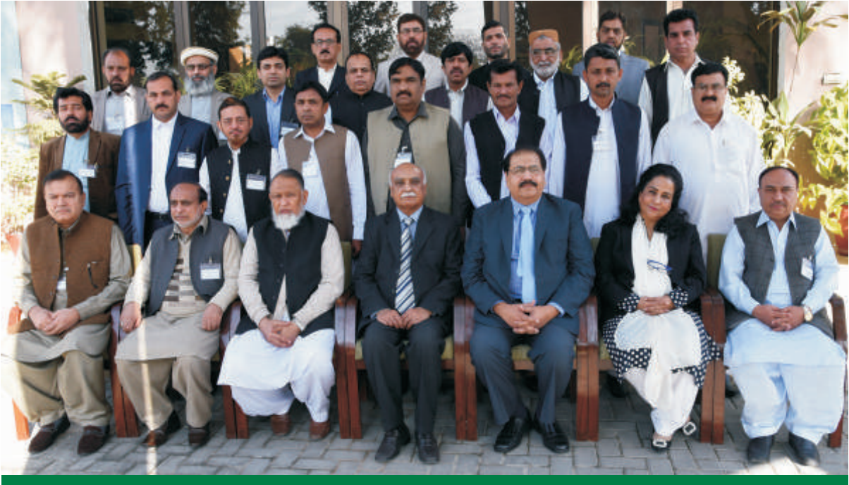
Superintendents in group photo with faculty members.

Director General, FJA, urged Superintendents of Sessions Courts to uphold highest standards of professionalism