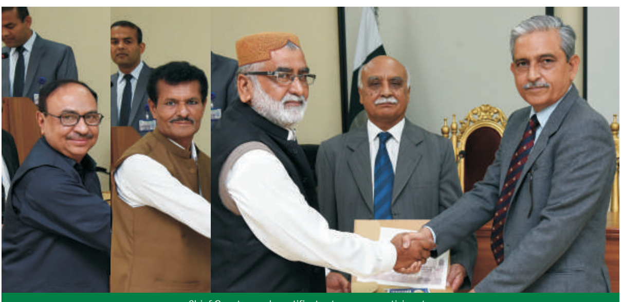
Chief Guest awards certificates to course participants.