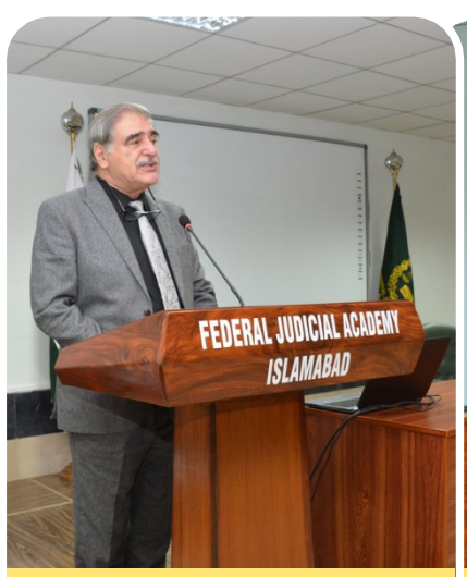
DG, FJA addressing during the inaugural session

The participants agreed that the course helped in developing critical thinking skills to make informed decisions and provided opportunities to network with professionals from other provinces.