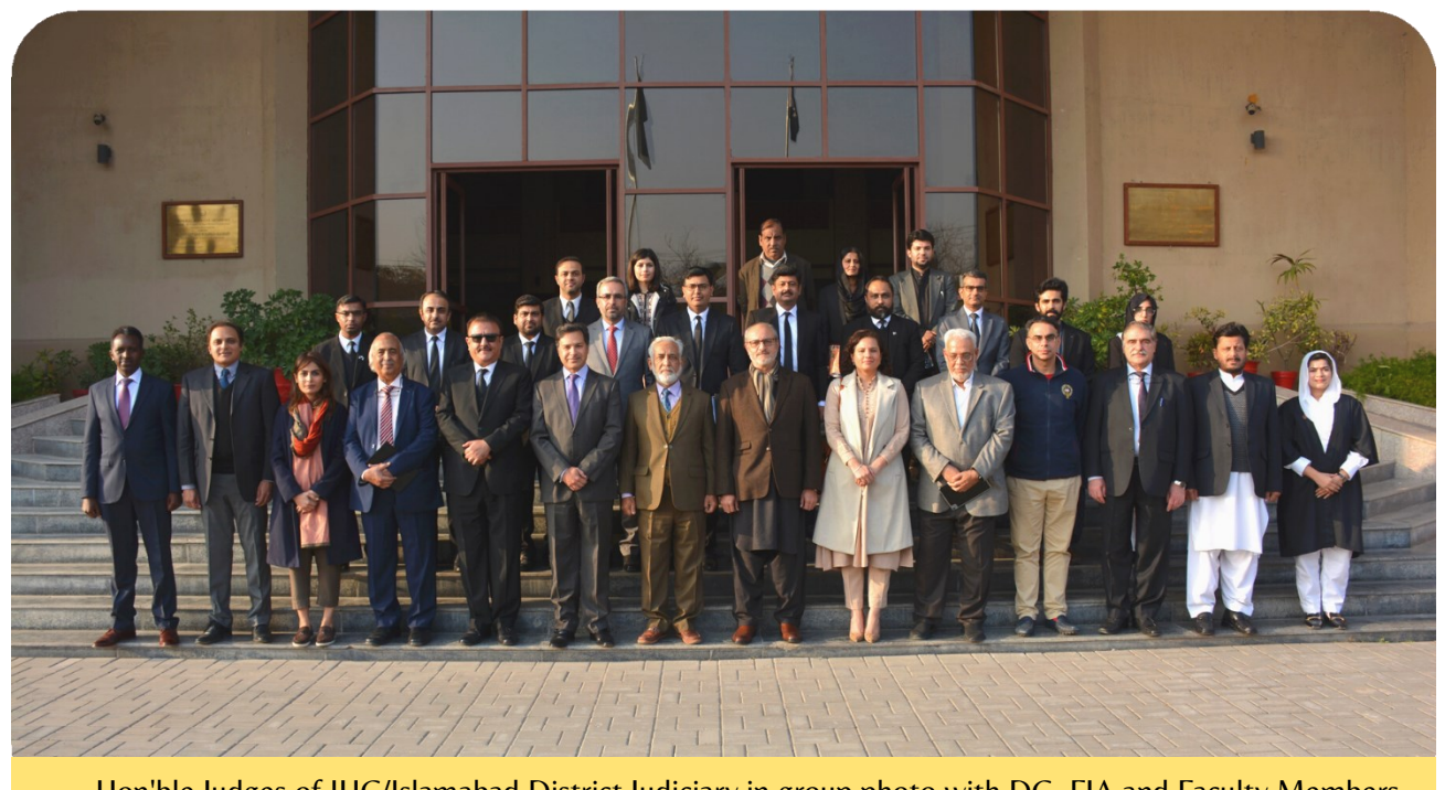
Hon'ble Judges of IHC/Islamabad District Judiciary in group photo with DG, FJA and Faculty Members