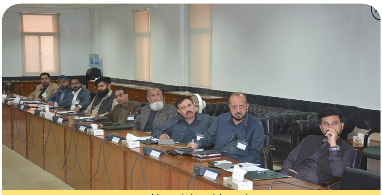
course participants during training session