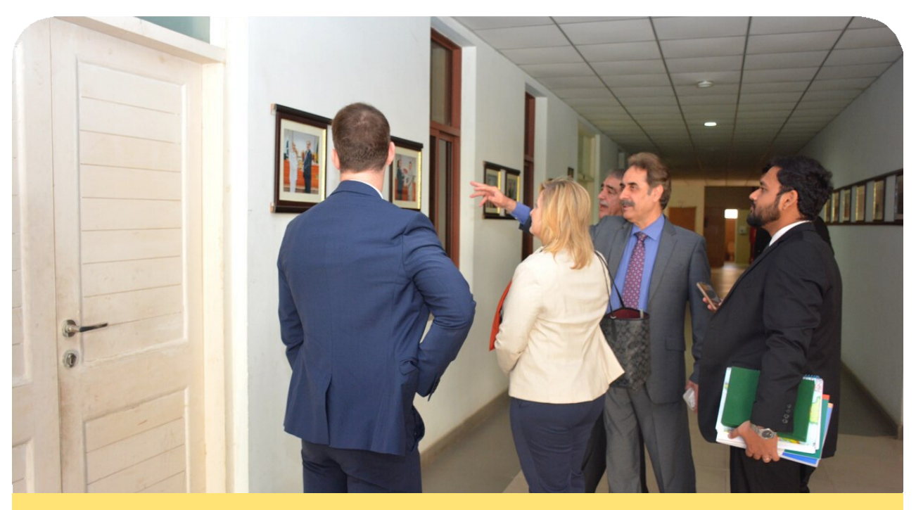
DG, FJA and Director (Academics and Training) accompany INL's delegation