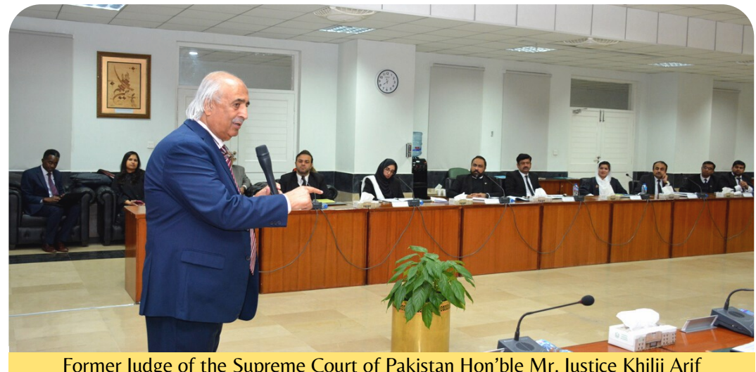
Former Judge of the Supreme Court of Pakistan Hon'ble Mr. Justice Khilji Arif Hussain (Retd.) addressing workshop participants