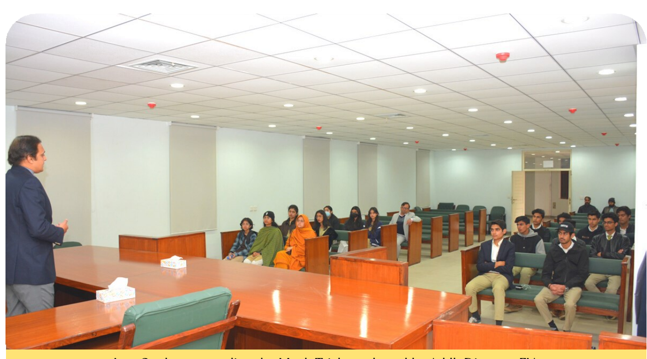
Law Students attending the Mock Trial, conducted by Addl. Director, FJA

The visiting students and teachers termed the visit to FJA a great learning opportunity especially for those students who are interested in pursuing a career in law. They claimed that this valuable learning experience will help them to develop skills, knowledge, and insights that are relevant to their academic and professional goals.