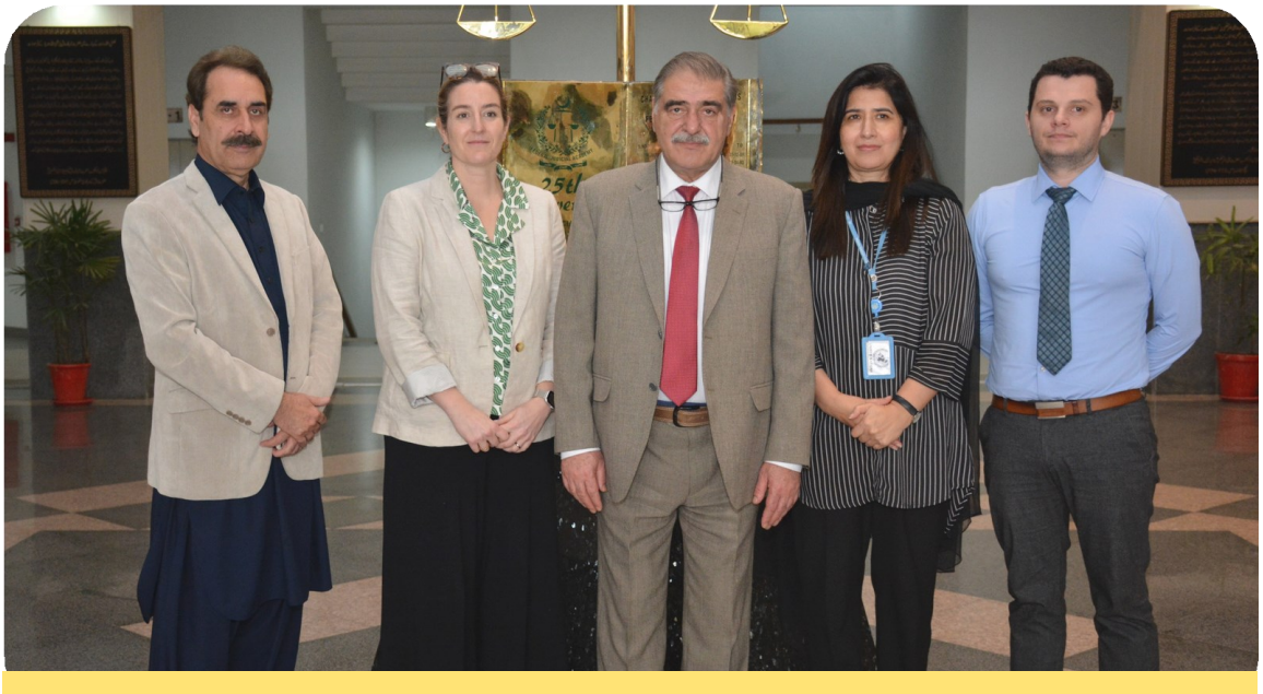
UNODC delegation with DG, FJA and Director Academics & Training