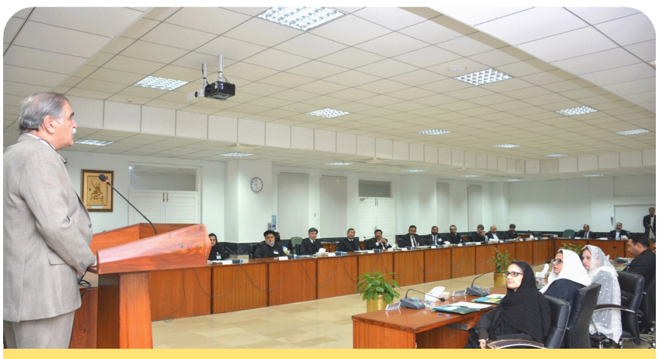
DG, FJA addressing the inaugural session of the course

The participants shared that the training will help them avoid common mistakes during trial proceedings, which include errors in evidence collection, failure to adhere to rules and procedures, and misinterpretation of legal concepts.