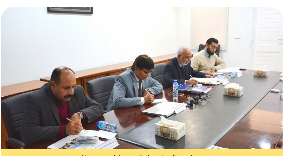
Group participants during the discussion