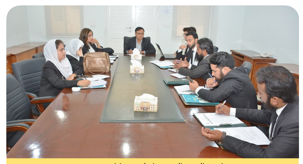
course participants during syndicate discussion