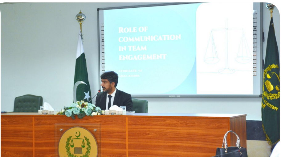
Participant heading the syndicate presentation