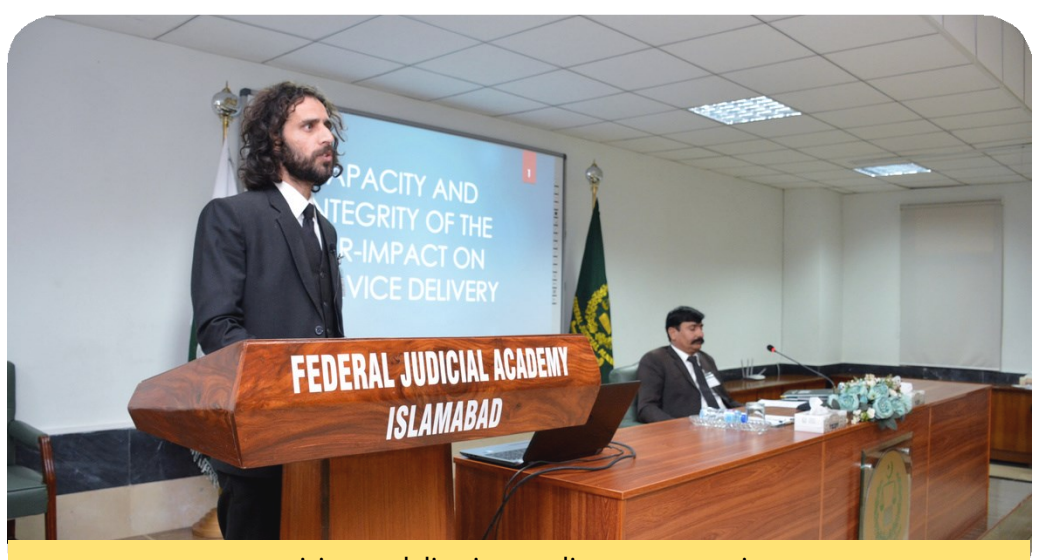
participants delivering syndicate presentation