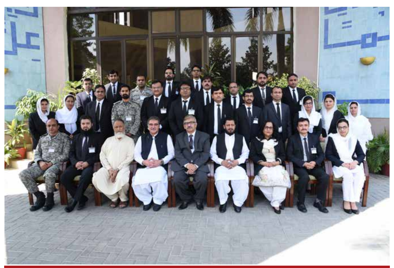
Participants in group photo with Chief Guest and FJA faculty members.

This five days training course was carried out through presentations on a variety of subjects/ topics on law of evidence, syndicate/group discussions, visit to Supreme Court of Pakistan and watching proceedings in Court Room No. 1, and conducted in a participatory process.