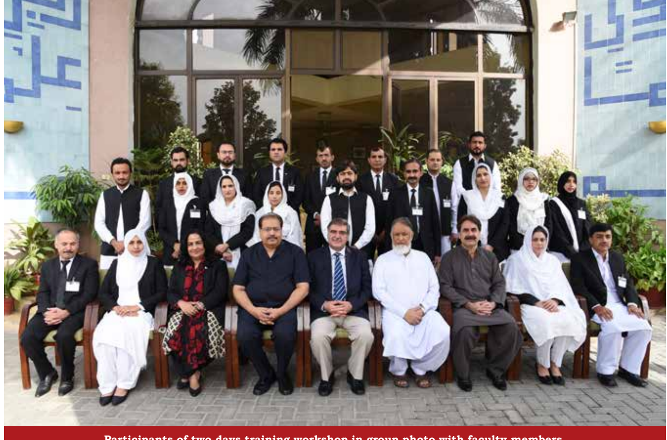
Participants of two days training workshop in group photo with faculty members.

Twenty one Civil Judges/ Judicial Magistrates attended this two days workshop at the Academy.