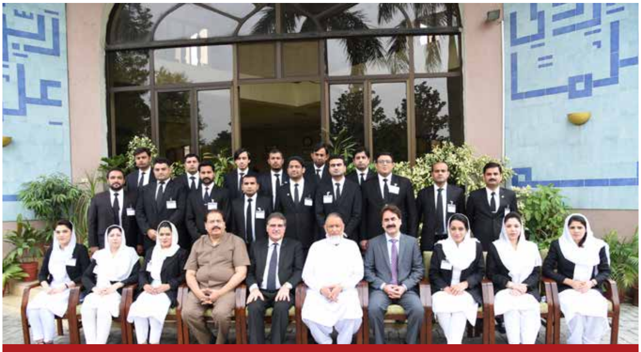
Newly appointed Civil Judges-cum-Magistrates from Punjab in group photo with FJA faculty members.

of Criminal Justice System", "Gender Concepts", "Deontology: Judicial Ethics for Qazis", "New Dimensions in Medical Jurisprudence", "Computer orientation/literacy", etc.