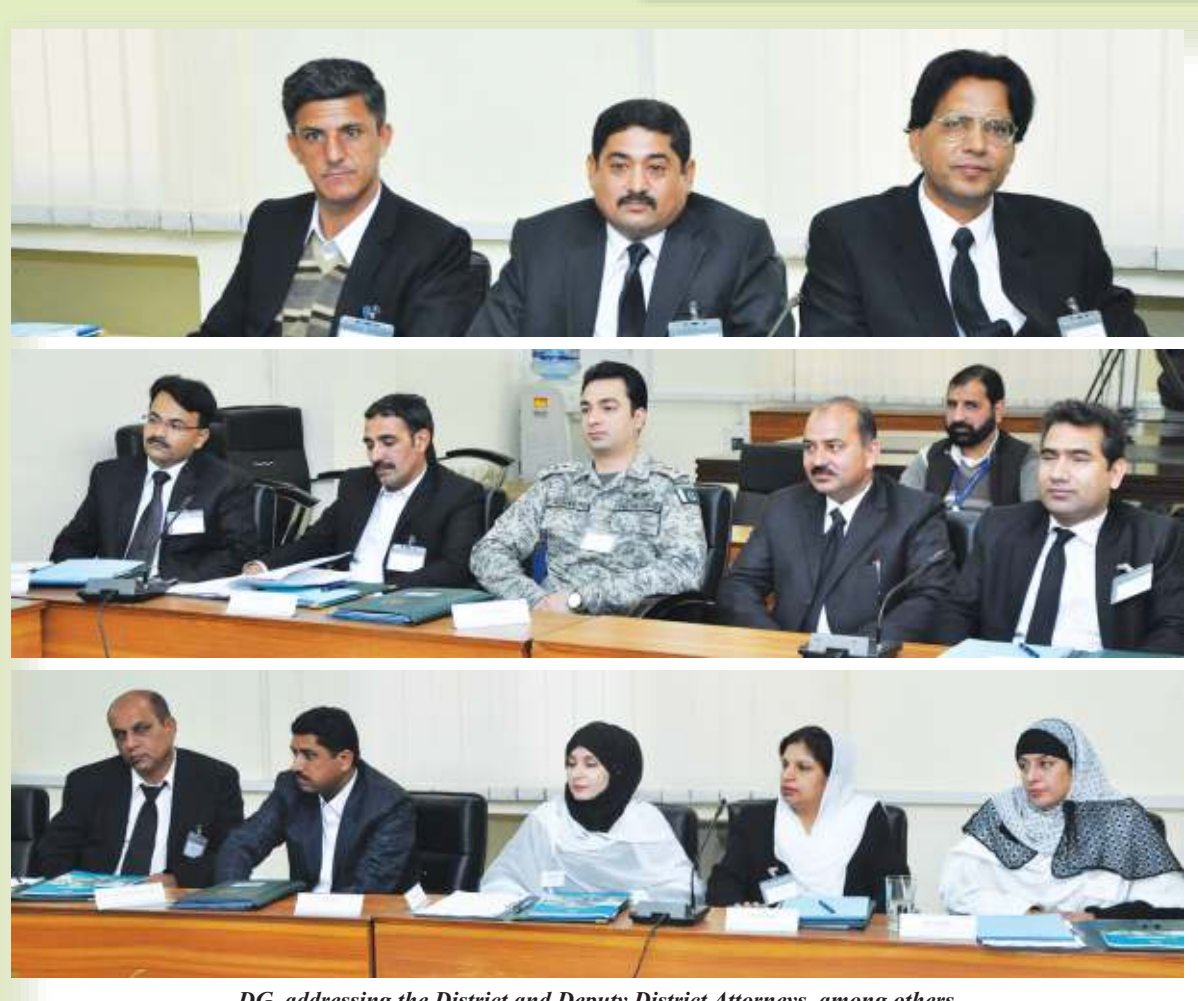
DG, addressing the District and Deputy District Attorneys, among others.

Gilgit-Baltistan and three Officers of Pakistan Air Force underwent this one week training course at the Academy.