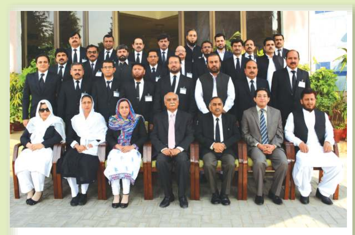
Trainees in group photo with Faculty members.

"STRENGTH DOES NOT COME FROM PHYSICAL CAPACITY. IT COMES FROM AN INDOMITABLE WILL."