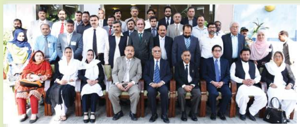
Law Officers in group photo with Faculty members.

It is true investing in the organizations and employees. To build a professional team and fully trained, high achievers, the Academy always arranges properly devised and developed training courses and hires the right people who can make a difference. They can't teach you everything but whatever they will share with you that will be extremely beneficial for you in the effective service delivery in the field.'