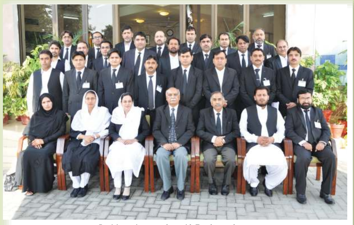
Participants in group photo with Faculty members.