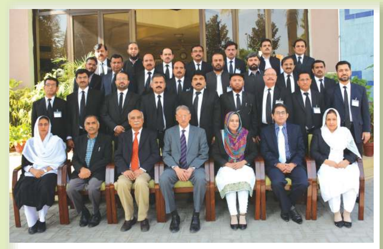
Participants in group photo with Registrar, SCP, and Faculty members.

KNOWLEDGE IS A TREASURE. BUT PRACTICE IS THE KEY TO IT."